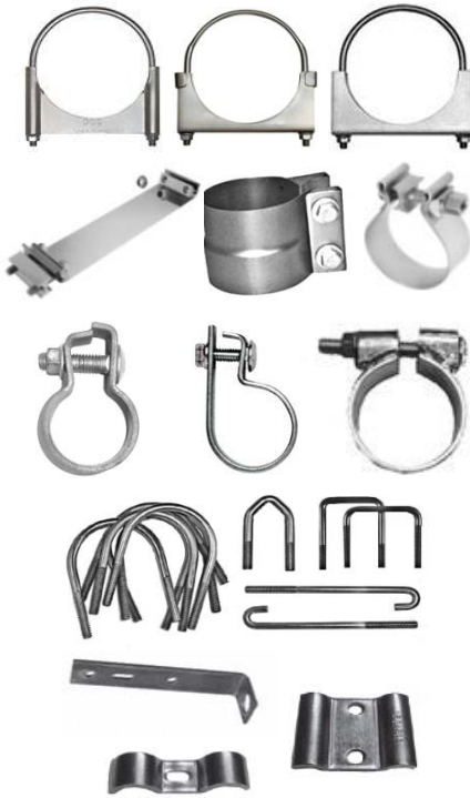
Made in the USA